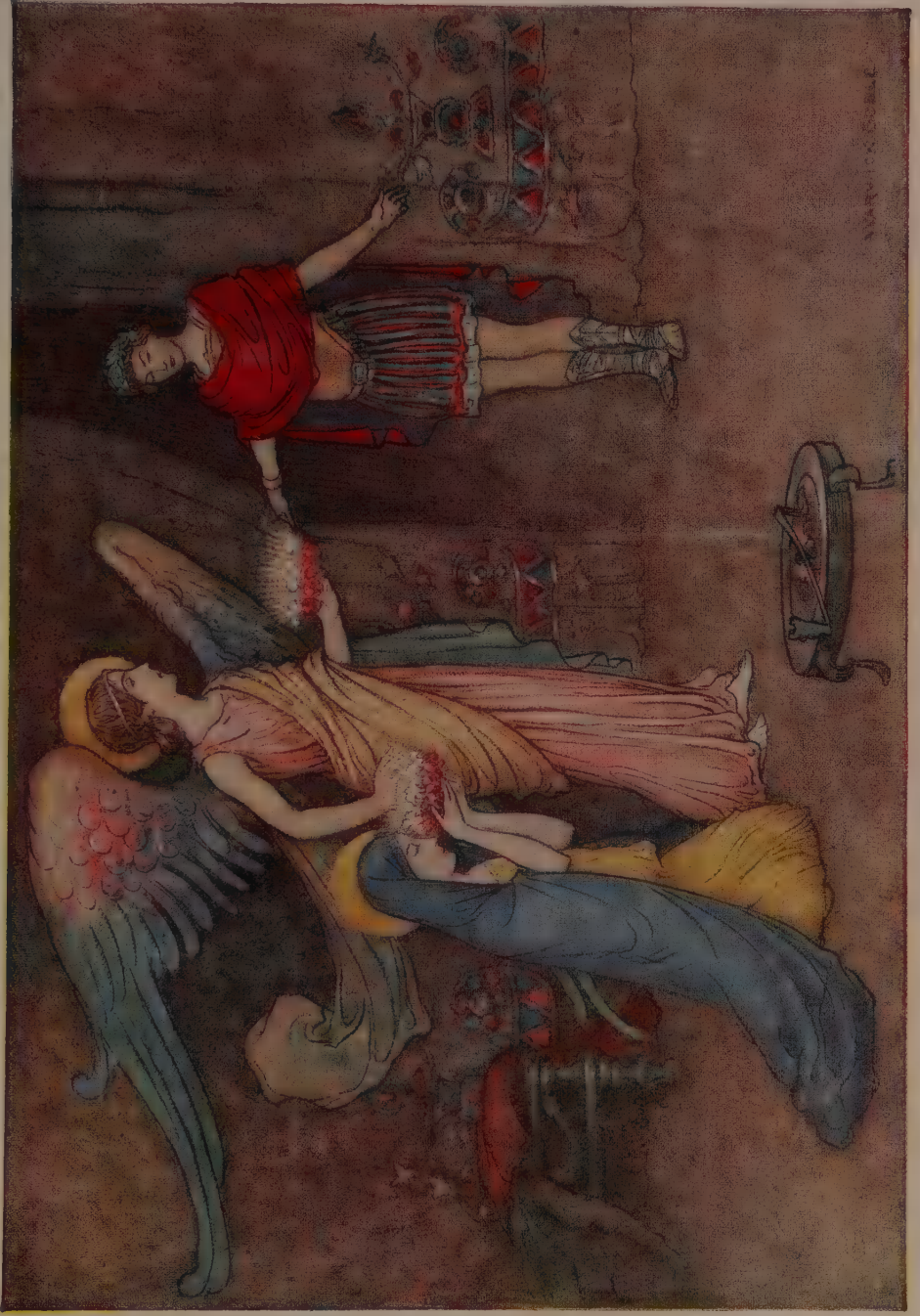
THE ANGEL PRESENTING THE CROWNS TO CECILY AND VALERIAN